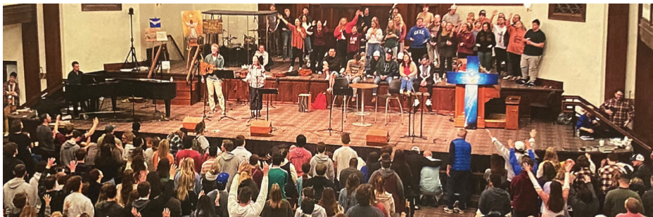
Hughes Auditorium at Asbury University, Cover of Decision Magazine, April 2023